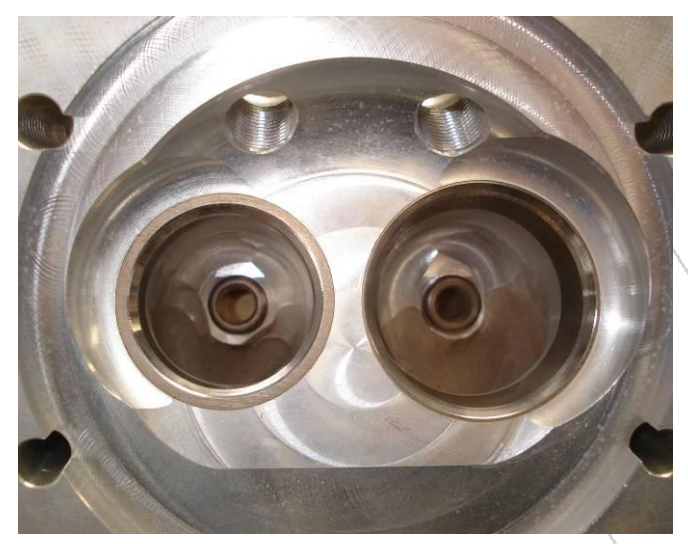
Figure 2 – Early "High Octane" Combustion Chamber

• The "High Octane" chamber can be modified as shown in Figure 3.